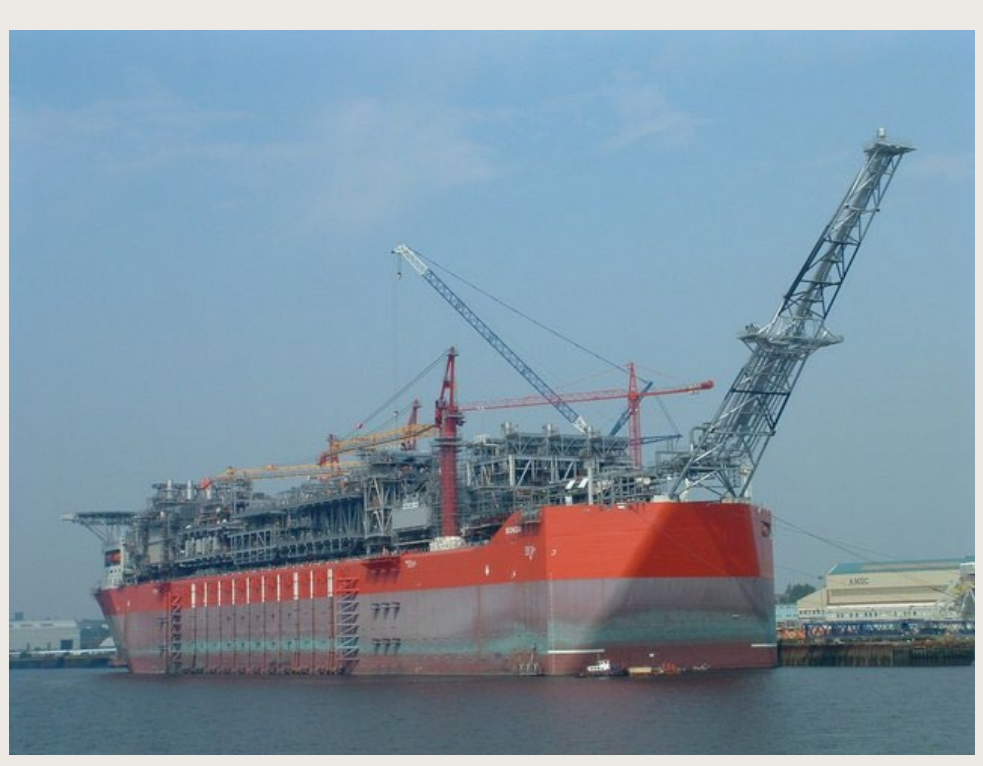
Vin Mullen CC BY-SA 3.0