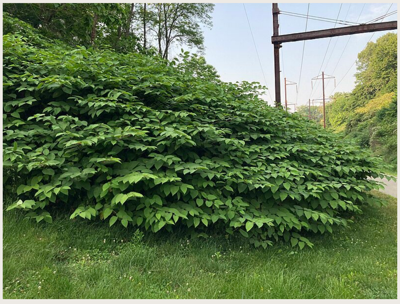
Awinch CC BY-SA 3.0