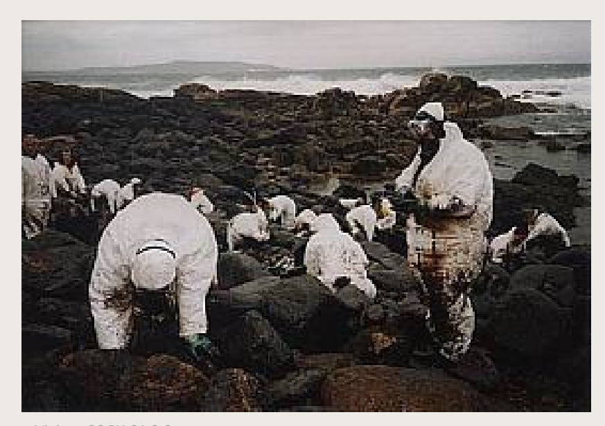
Viajero CC BY-SA 3.0